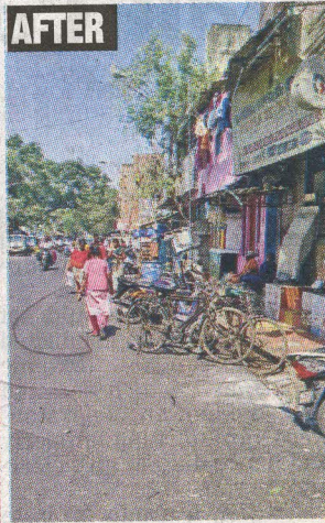
Back breaking pits and stagnated water on Brick kiln Road replaced by a fresh black coat of tar paint. —DC

said the move brings relief to 450 odd families and thousands of regular road users.